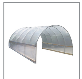
Jiggly Greenhouse® DIY Greenhouse Kits

Jiggly Greenhouse® strives to bring our customers the highest quality products for simply unbeatable prices. We are the industry leader offering a huge selection of do-it-yourself greenhouses, parts and accessories. For questions, pricing, technical support or more, reach out to one of our trained professionals at one of the links below: