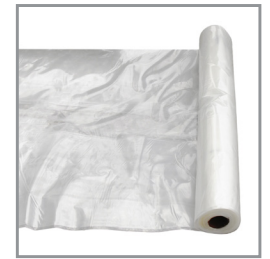
Jiggly Greenhouse® Poly Grow Film -JGFILM