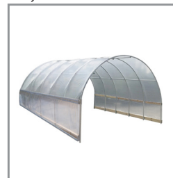
Jiggly Greenhouse® DIY Greenhouse Kits

Jiggly Greenhouse® strives to bring our customers the highest quality products for simply unbeatable prices. We are the industry leader offering a huge selection of do-it-yourself greenhouses, parts and accessories. For questions, pricing, technical support or more, reach out to one of our trained professionals at one of the links below: