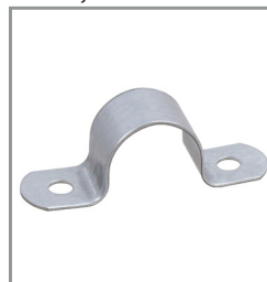
Jiggly Greenhouse® 1 3/8" Pipe Strap - JG-JGPS-138