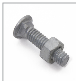
Jiggly Greenhouse® 5/16" x 1 1/4" Carriage Nuts & Bolts - JG-CB51614