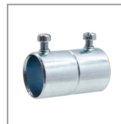
Jiggly Greenhouse® EMT Conduit Sidewall Set Screw Coupling - JG-JGC-34