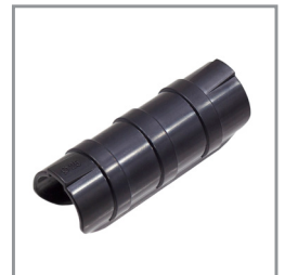
Jiggly Greenhouse® Sidewall Roll Up Clips - JG-SC1-25MM